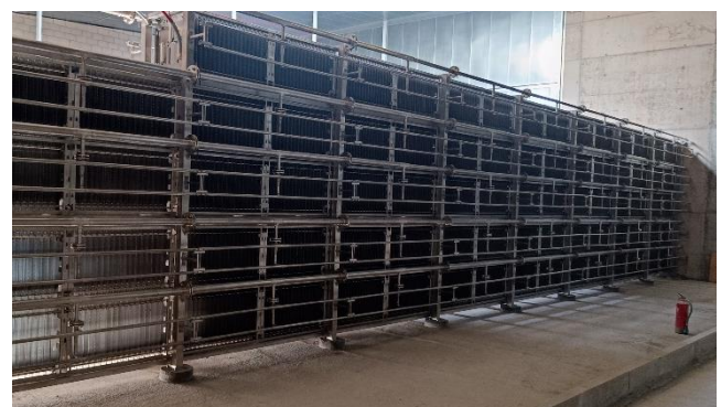
Electrostatic filter units