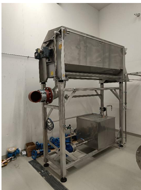
Overview of the plant