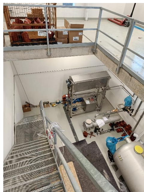
Placement by the customer