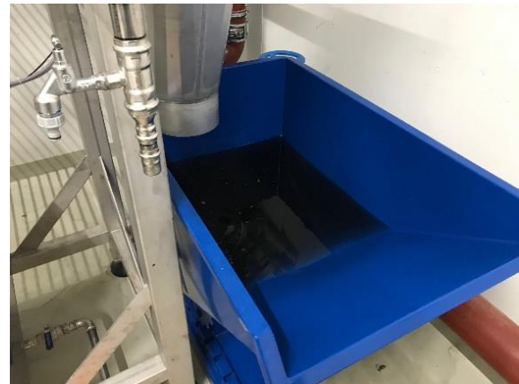
Collection container of lints and fibres

APPLICATION: Treatment of colour wastewater from textile dyeing, retention of lints and fibres PROCEDURE: Screen drum with perforation 0,25 mm retains textile fibres REALISATION: 2022 LOCATION: Germany